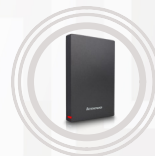
Lenovo UHD F309 1TB Portable Secure Hard Drive