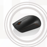
Lenovo 300 Wireless Compact Mouse