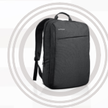
Lenovo Casual Backpack B200