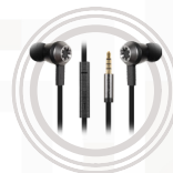
Lenovo 500 Extra Bass In-Ear Headphone