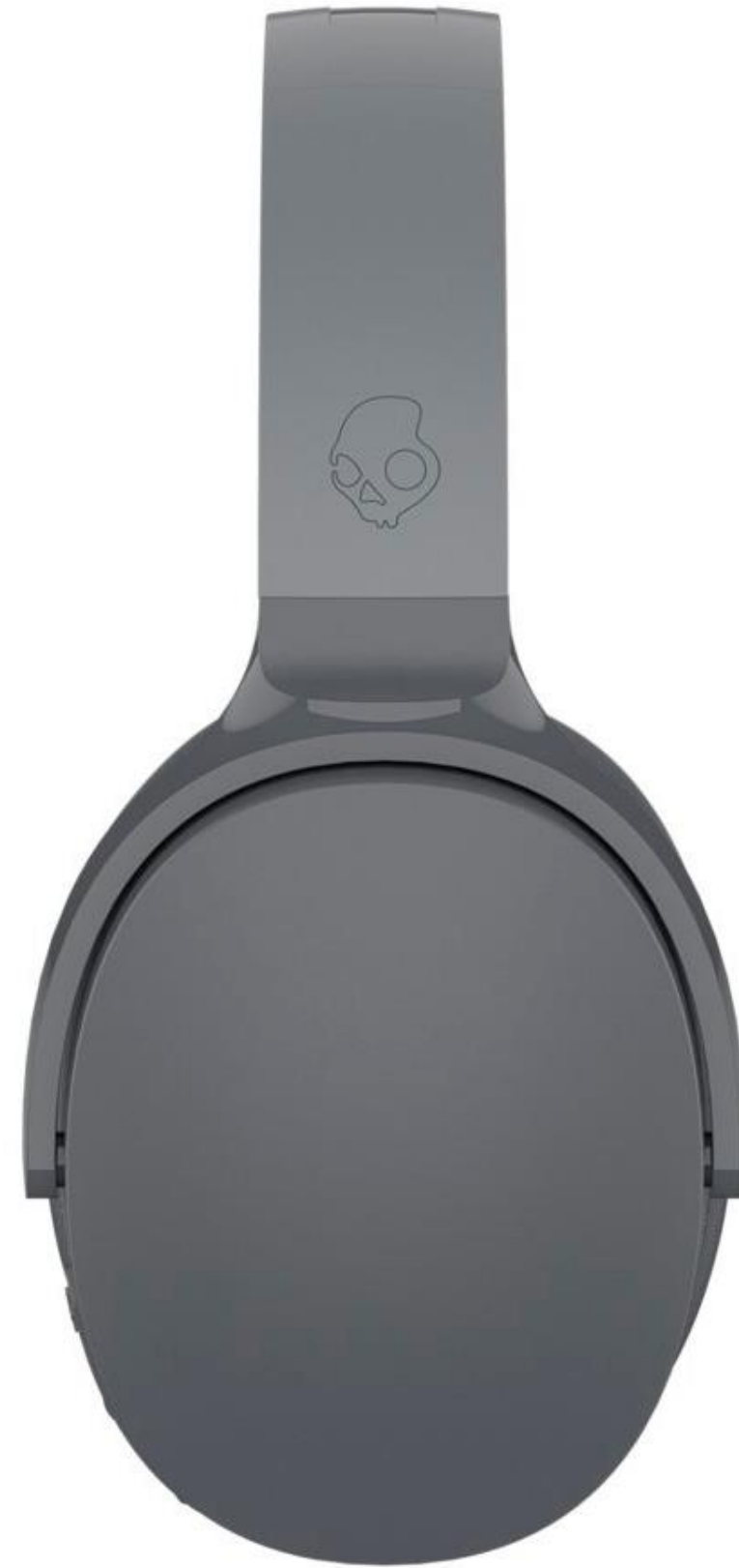
S6HTW-K441 GRAY/GRAY 9/1/17