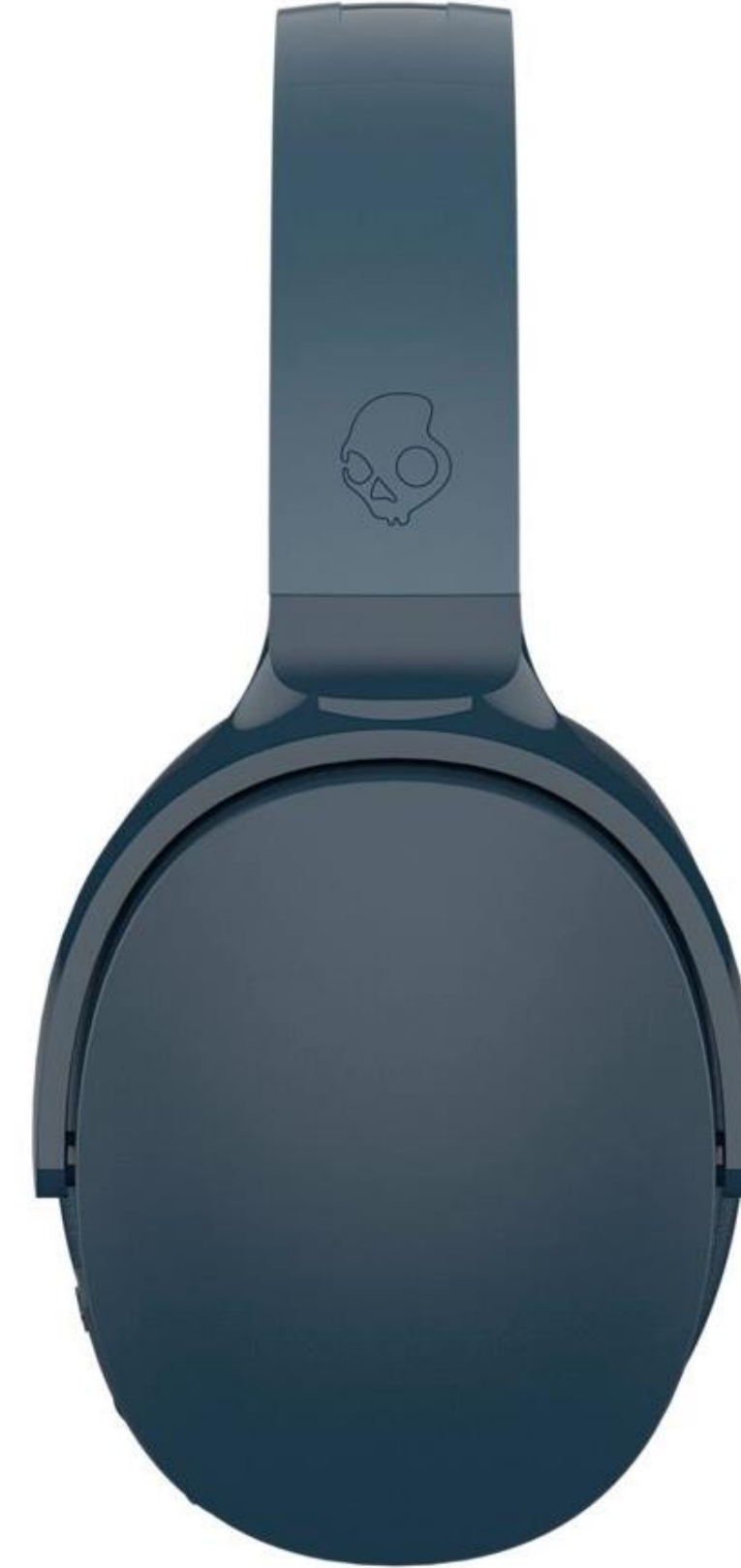
S6HTW-J617 BLUE/BLUE 9/1/17