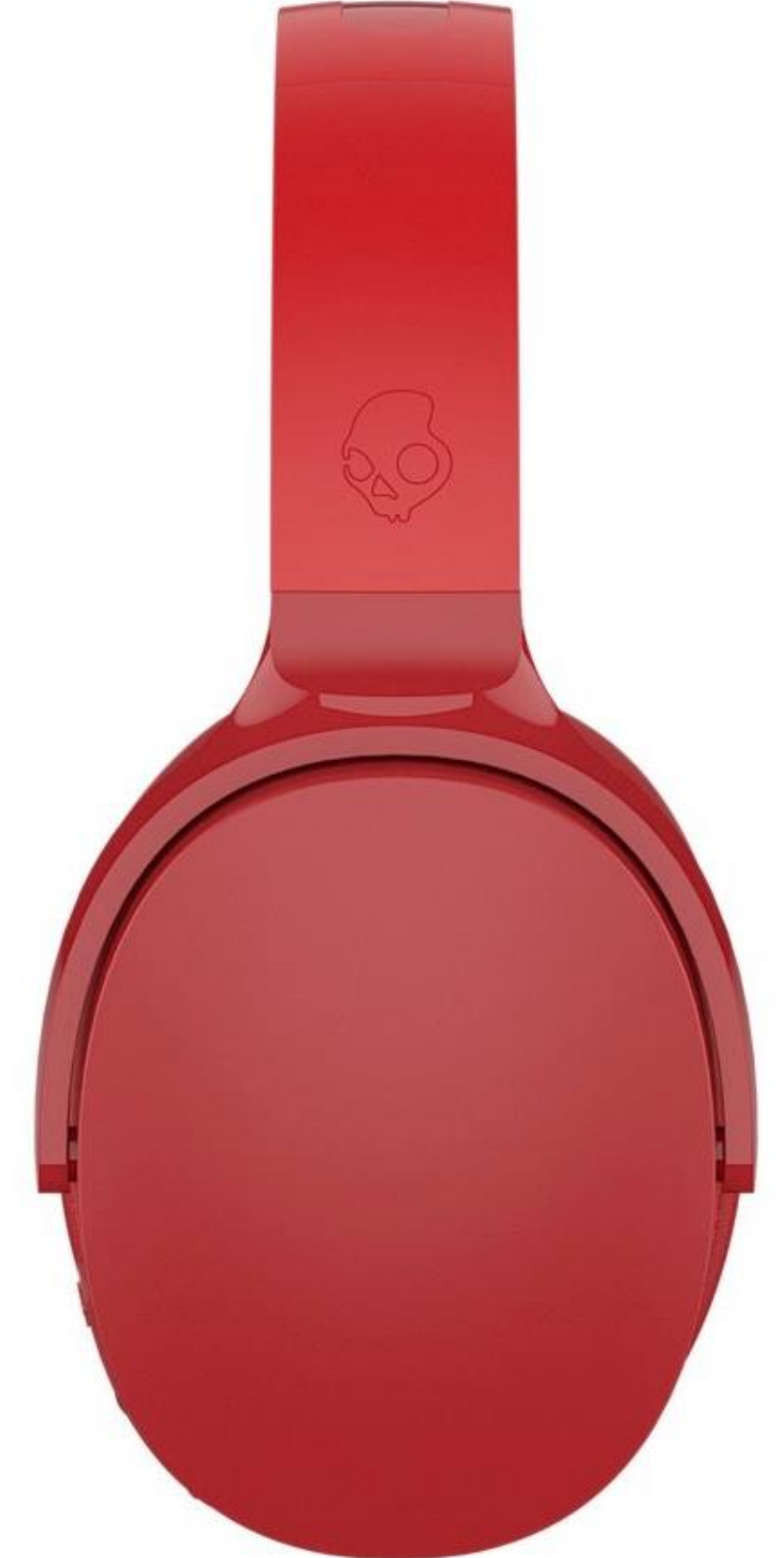
S6HTW-K613 RED/RED 9/1/17