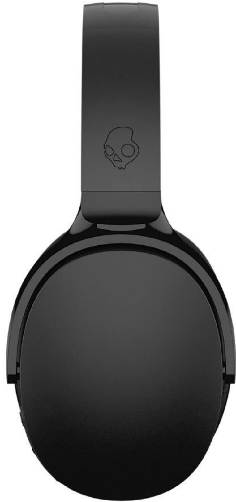
S6HTW-K033 BLACK/BLACK 9/1/17