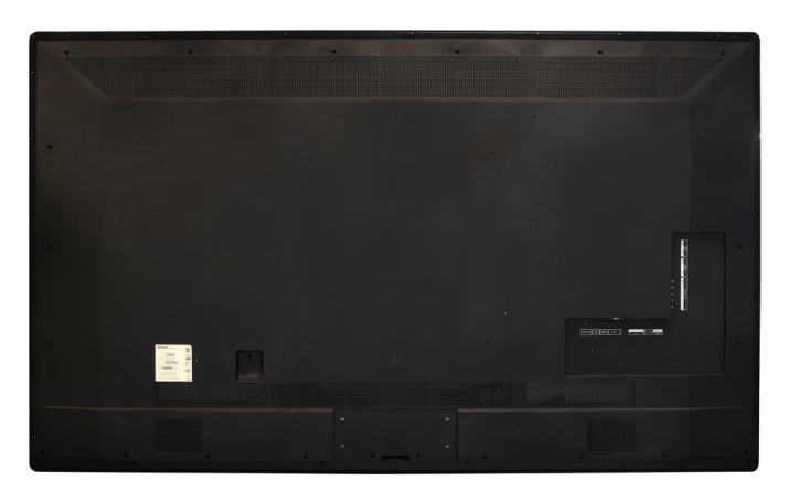
INF7001 back panel

©2014 InFocus Corporation. All rights reserved. Specifications are subject to change without further notice. InFocus, InFocus The New Way to Collaborate and JTouch are either trademarks or registered trademarks of InFocus Corporation in the United States and other countries. All trademarks are used with permission or are for identification purposes only and are the property of their respective companies. InFocus-JTouch-2page-Datasheet-EN-28FEB14.