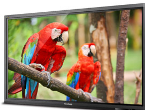
Full HD Resolution

For more product information, visit us at www.viewsoniceurope.com