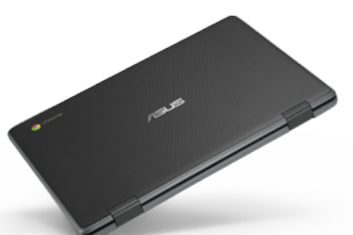
to ensure the