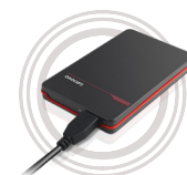
F310S USB 3.0 External Backup Hard Drive