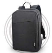
Lenovo 15.6" Laptop Casual Backpack B210