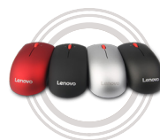
Lenovo 500 Wireless Compact Precision Mouse