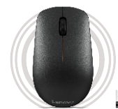
Lenovo 400 Wireless Mouse