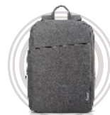
Lenovo 15.6" Laptop Casual Backpack B210