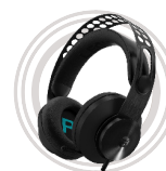
Legion H300 Stereo Gaming Headset