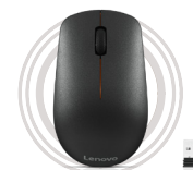
Lenovo 400 Wireless Mouse