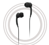
Lenovo 100 In-Ear Headphone