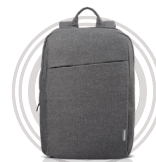
Lenovo 15.6" Laptop Casual Backpack B210