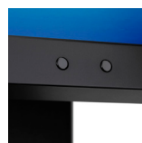
Ambient and human sensors