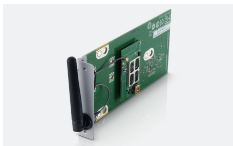
Easily connect to a wireless network with the optional Wireless Print Server (sold separately).