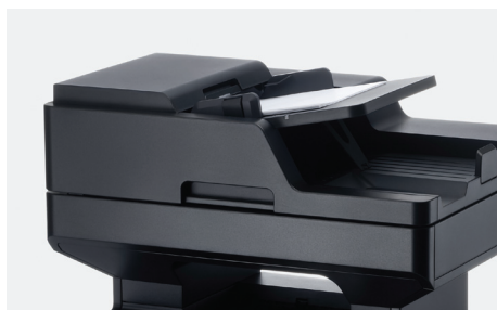
Scan two-sided documents at outstanding speeds of up to 70 sides per minute (spm) (A4) with the built-in dual scan sensor DADF