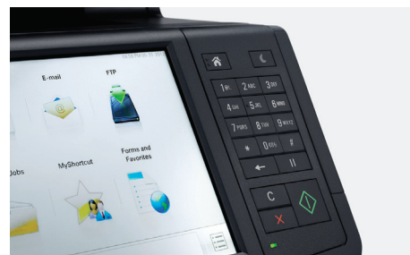
Ease of operation with intuitive 10.2 inch (25.9 cm) LCD touch screen and control panel.