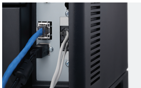
Fast data transmission with Gigabit Ethernet 10/100/1000.