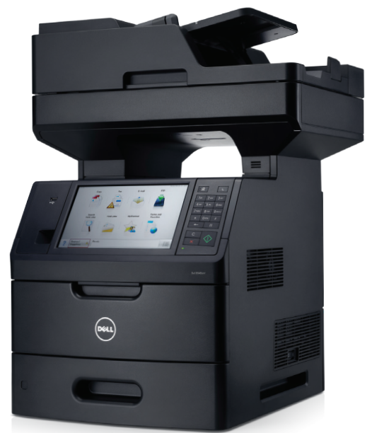
Dell™ B5465dnf Mono Laser Multifunction Printer

Featuring a low cost per page, high duty cycle and robust scalability, this printer offers outstanding value and can easily meet demanding business printing needs. Help improve office efficiency by customising this powerful workgroup multifunction printer with various accessories and options.