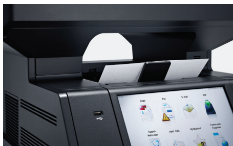
Increase efficiency with fast print speeds of up to 66ppm (A4) 1 and automatic two-sided printing.