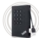
ThinkPad® USB 3.0 Portable Secure Hard Drive Fast & Secure