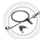
Kensington® MicroSaver® Security Cable Lock by Lenovo™ Ultra Protection Against Thieves