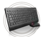
Lenovo™ Ultralim Wireless Keyboard and Mouse Combo Fast & Fluid