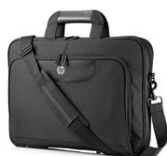
HP Value Top Load 18-inch Case QB683AA