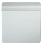
HP Z6500 Wireless Trackpad H4F06AA