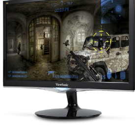
Game Mode OFF