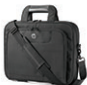
HP Value Top Load 16.1-inch Case QB681AA